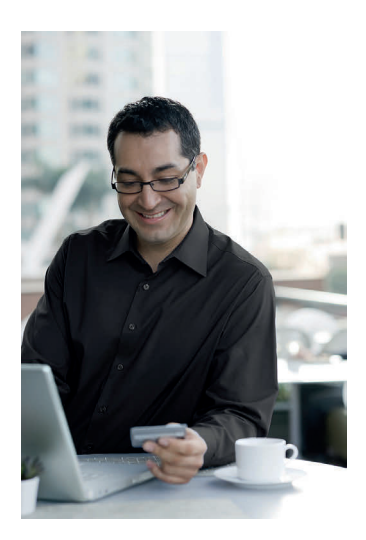
VISA CREDIT CARD It's There For You

If you can file early, this reduces your chances of having this scam pulled on you. Be careful to guard your social security number and other vital data about you.